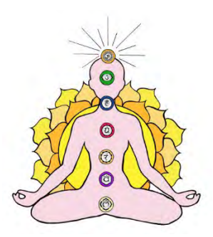
Chakra Chant: Ram Ram

Ram is the seed syllable for the solar plexus (closely associated with the organs of digestion). This chant is a form of sacred toning for the solar plexus. Each of the seven major chakras are affected by particular sounds and mantras. These are single syllables that can be chanted to strengthen the energy of the respective chakras. The seed syllables are as follows: LAM (root chakra), VAM (sacral chakra), RAM (solar plexus chakra), YAM (heart chakra), HAM (throat chakra), OM or AH (third eye chakra), and AH or ANG (crown chakra).