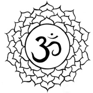
Crown Chakra (7 th ) Sanskrit Name: Sahasrara

Sargam: DHA (duh-ha) Seed Syllable: OM (oohhmm) Vowel: A (aaay) Mantra: OM Namaha Deities: Krishna