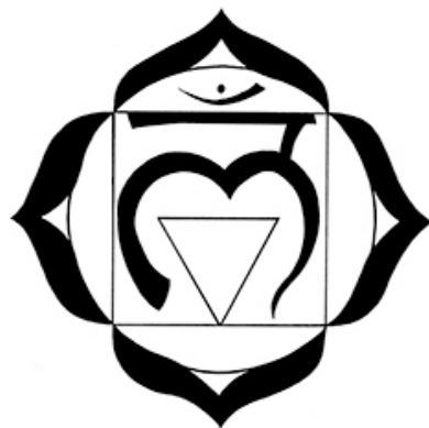
Base or Root Chakra (1st) Sanskrit Name: Muladhara

Book PDF Available on Website Paperback at Amazon and Barnes & Noble Online