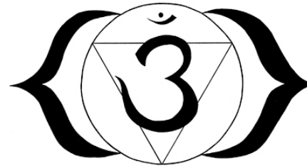
Third Eye Chakra (6 th ) Sanskrit Name: Ajna

Sargam: PA (pah) Seed Syllable: HAM (hum) Vowel: I (eye) Mantra: OM Ham Namaha Deities: Sadashiv