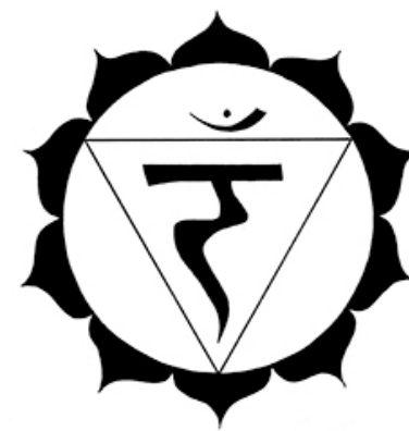
Solar Plexus Chakra (3 rd ) Sanskrit Name: Manipura