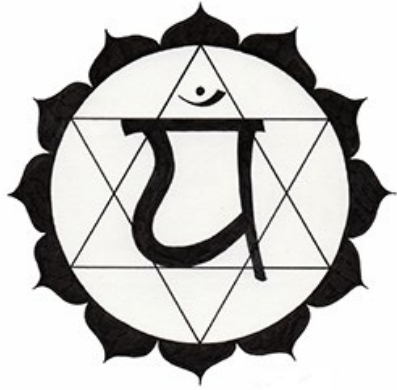
Heart Chakra (4 th ) Sanskrit Name: Anahata