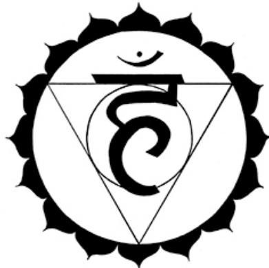
Throat Chakra (5 th ) Sanskrit Name: Vishuda

Sargam: MA (mah) Seed Syllable: YAM (yum) Vowel: AH (aah) Mantra: OM Yam Namaha Deities: Hanuman