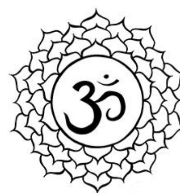
Crown Chakra (7 th ) Sanskrit Name: Sahasrara

Sargam: DHA (duh-ha) Seed Syllable: OM (oohhmm) Vowel: A (aaay) Mantra: OM Namaha Deities: Krishna Chants: Devakinanadana Gopala