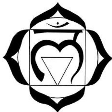
Base or Root Chakra (1st) Sanskrit Name: Muladhara