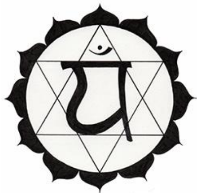
Heart Chakra (4 th ) Sanskrit Name: Anahata