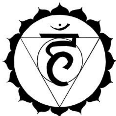
Throat Chakra (5 th ) Sanskrit Name: Vishuda

Sargam: MA (mah) Seed Syllable: YAM (yum) Vowel: AH (aah) Mantra: OM Yam Namaha Deities: Hanuman Chants: Hanuman Jaya Ram