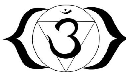
Third Eye Chakra (6 th ) Sanskrit Name: Ajna

Sargam: PA (pah) Seed Syllable: HAM (hum) Vowel: I (eye) Mantra: OM Ham Namaha Deities: Sadashiva Chants: Sadashiva Deva